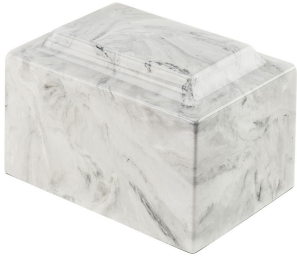
Greytone Marble Price: $350 Cultured Marble Victoriaville US335-20004 Size: 7Wx6.5Hx10L