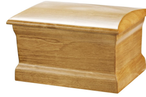
Artisan Earthtone Price: $295 Wood Victoriaville US150-00276 Size: 6"D x 10.5L x 7.5"W