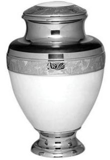
Mother of Pearl Price: $345 Metal Gravure craft UR-1734 Size: 7"D x 10"H