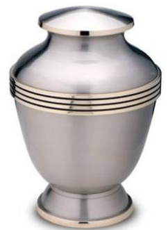
Elegant Pewter Price: $520 Brass Dodge 960251 Size: 12"H x 7.25"D Also available in copper, gold, sapphire and floral