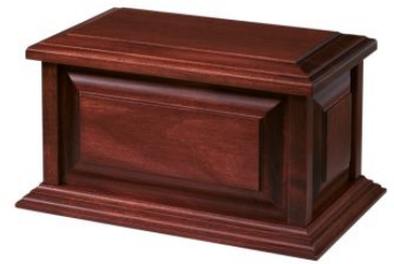
Brentwood Price: $385 Hardwood Victoriaville US210-00013 Size: 7Wx12Lx6.5D