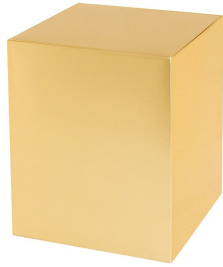
Sheet Bronze Price: $215 Brass Victoriaville US235-20001 Size: 5.6W x 5.6L x 7D