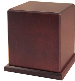
Sherwood Price: $365 Wood Victoriaville US150-00001 Size: 7.8"W x 8.4"D x 7.8"L