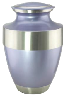
Elite Starlight Price: $355 Metal Victoriaville US430-05201 Size: 6"W x 10.25"H Also available in bronze