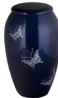
Purple Pearl Butterfly Price: $440 Aluminum Gravure craft UR-7100 Size: 6"D x 10.75"H