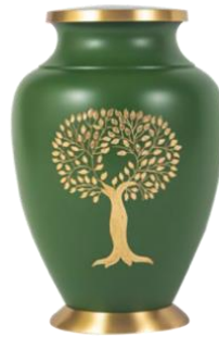
Tree of Life Price: $355 Brass Gravure craft UR-3101 Size: 6.25"D x 9.75"H