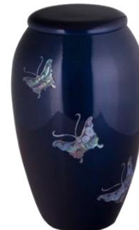
Purple Pearl Butterfly Price: $440 Aluminum Gravure craft UR-7100 Size: 6"D x 10.75"H