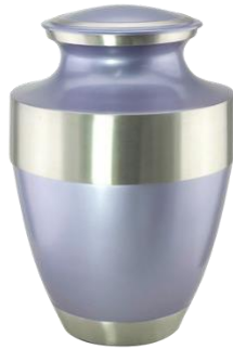
Elite Starlight Price: $355 Metal Victoriaville US430-05201 Size: 6"W x 10.25"H Also available in bronze