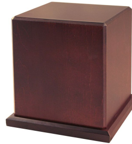
Sherwood Price: $365 Wood Victoriaville US150-00001 Size: 7.8"W x 8.4"D x 7.8"L