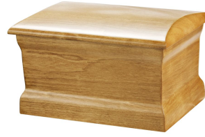
Artisan Earthtone Price: $295 Wood Victoriaville US150-00276 Size: 6"D x 10.5L x 7.5"W