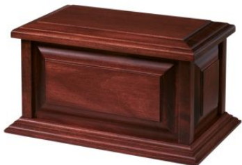
Brentwood Price: $340 Hardwood Victoriaville US210-00013 Size: 7Wx12Lx6.5D