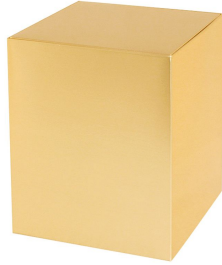
Sheet Bronze Price: $190 Brass Victoriaville US235-20001 Size: 5.6W x 5.6L x 7D