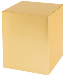
Sheet Bronze Price: $190 Brass Victoriaville US235-20001 Size: 5.6W x 5.6L x 7D