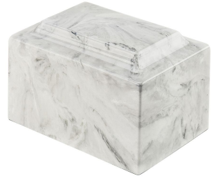
Greystone Marble Price: $300 Cultured Marble Victoriaville US335-20004 Size: 7Wx6.5Hx10L