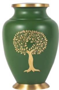
Tree of Life Price: $335 Brass Gravure craft UR-3101 Size: 6.25"D x 9.75"H