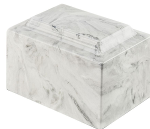
Greytone Marble Price: $300 Cultured Marble Victoriaville US335-20004 Size: 7Wx6.5Hx10L