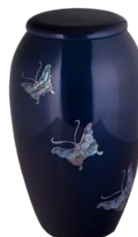
Purple Pearl Butterfly Price: $440 Aluminum Gravure craft UR-7100 Size: 6"D x 10.75"H