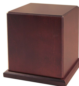
Sherwood Price: $365 Wood Victoriaville US150-00001 Size: 7.8"W x 8.4"D x 7.8"L