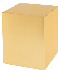
Sheet Bronze Price: $215 Brass Victoriaville US235-20001 Size: 5.6W x 5.6L x 7D