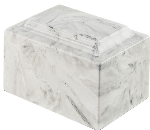
Greytone Marble Price: $350 Cultured Marble Victoriaville US335-20004 Size: 7Wx6.5Hx10L