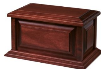
Brentwood Price: $385 Hardwood Victoriaville US210-00013 Size: 7Wx12Lx6.5D