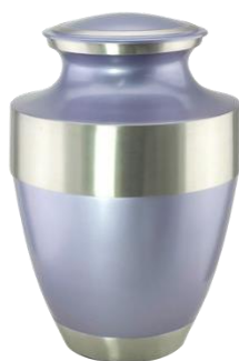
Elite Starlight Price: $355 Metal Victoriaville US430-05201 Size: 6"W x 10.25"H Also available in bronze