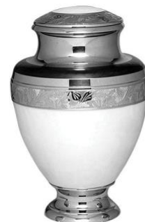
Mother of Pearl Price: $345 Metal Gravure craft UR-1734 Size: 7"D x 10"H