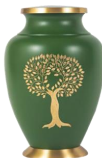
Tree of Life Price: $355 Brass Gravure craft UR-3101 Size: 6.25"D x 9.75"H