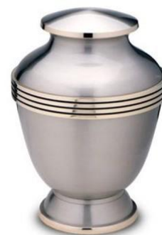
Elegant Pewter Price: $520 Brass Dodge 960251 Size: 12"H x 7.25"D Also available in copper, gold, sapphire and floral