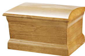
Artisan Earthtone Price: $295 Wood Victoriaville US150-00276 Size: 6"D x 10.5L x 7.5"W