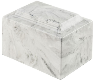
Greytone Marble Price: $350 Cultured Marble Victoriaville US335-20004 Size: 7Wx6.5Hx10L