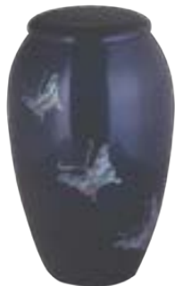
Purple Pearl Butterfly Price: $420 Aluminum Gravure craft UR-7100 Size: 6"D x 10.75"H