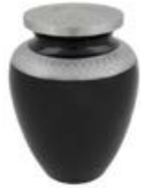
Celeste Charcoal Price: $330 Alloy Dodge 941701 Size: 9.4"D x 6.9"H Also available in indigo