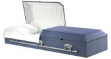
Toledo Price: $900 Victoriaville DR220-00040 Exterior: Blue Cloth Interior: White Silk Dimensions: 79.5L-25W-16.5H