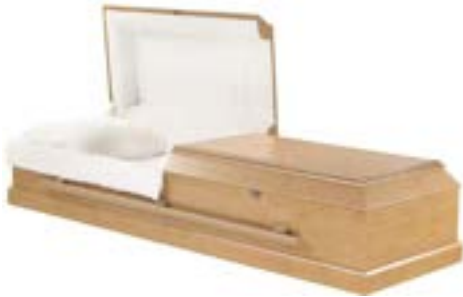
Alder Price: $1150 Victoriaville PV272-00005PV Exterior: Woodgrain Interior: Beige Crepe Dimensions: 81.7L-29W-19.7H