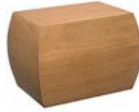
Braxton Maple Price: $275 Wood Batesville 255706 Size: 6.8"D x 6.5"H x 9.2"W Also available in honey brown