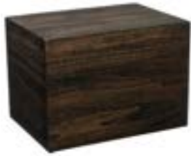
Mocha Hardwood Price: $225 Hardwood Batesville 255701 Size: 6"W x 5"D x 4"H Also available in light and medium wood