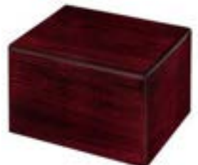
Traditional Price: $770 Wood Batesville 216023 Size: 10"W x 8"D x 6"H