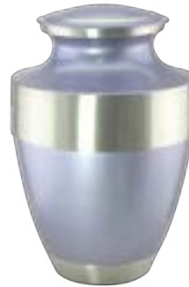
Elite Starlight Price: $385 Metal Victoriaville US430-05201 Size: 6"W x 10.25"H Also available in bronze