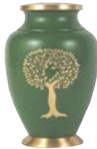
Tree of Life Price: $340 Brass Gravure craft UR- 3101 Size: 6.25"D x 9.75"H