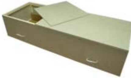
Basic LP Container Price: $350 Victoriaville CM879-00004 Exterior Size: 78L-27W-16H Exterior Material: Particle Board Model: Oversized – Up to 350 lbs