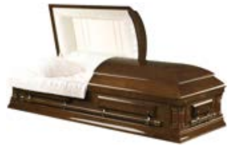
Newington Price: $1625 Victoriaville WC252-00008-CC Exterior Material: Poplar and Veneer Components, High Gloss Finish Interior: Tan Crepe Dimensions: 82.4L-28.3W-22.5H