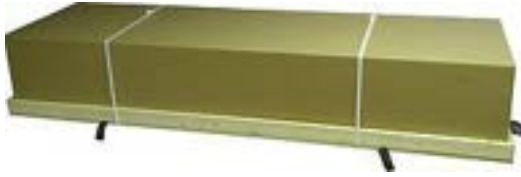
Cremation Container Price: $150 Williams Stratford 26 Exterior Material: Particle Board Model: Up to 250lbs Dimensions: 79L-24W-14H