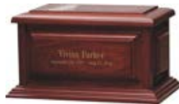
Fairmont Cherry Price: $510 Cherry Wood Eckels 3523 Size: 11.9"W x 7.4"L x 6.25"H