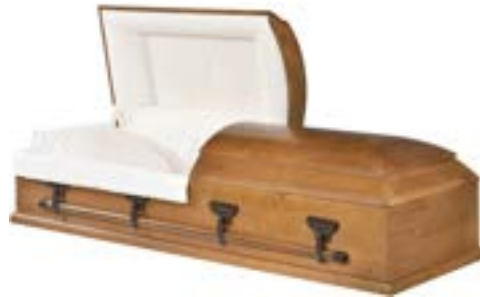
Puma Price: $1490 Victoriaville WR252-00180-CC Exterior Material: Poplar and Veneer Components, Rustic Brown Colour Interior: Beige Crepe Dimensions: 81L-27W-20H