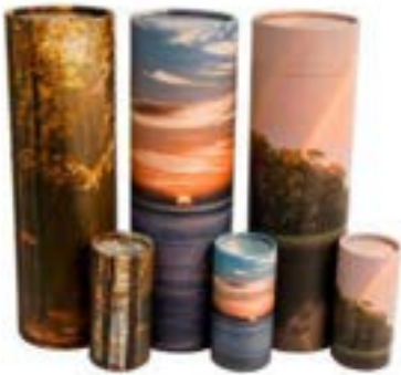
Scattering Tubes Full Size: $140 Mini: $70 Gravure craft 8101, 8106, 8107 Internal Size: 5.1”D x 12/6”H Material: Biodegradable Paper Many designs available