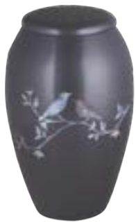
Grey Song Birds Price: $420 Aluminum Gravure craft UR-7124 Size: 6"W x 10"H Also available in purple