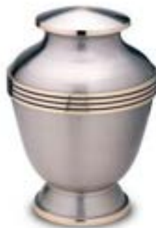
Elegant Pewter Price: $455 Brass Dodge 960251 Size: 12"H x 7.25"D Also available in copper, gold, sapphire and floral