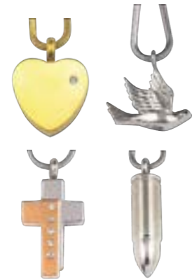
Cremation Pendants Price: $100 Gravure craft URJ-1350, 1000, 1390, 1210 Material: Stainless Steel Many designs available