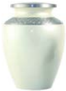
Celeste Pearl Price: $330 Alloy Dodge 941801 Size: 9.4"D x 6.9"H