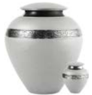
Shimmering Grey Price: $420 Metal Dodge 941900 Size: 8.5"D x 7.3"H