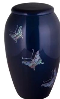
r le earl tter l r ce