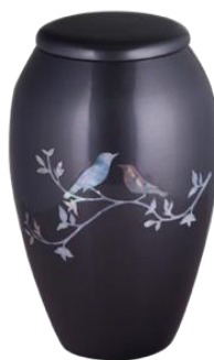
re o r s r ce