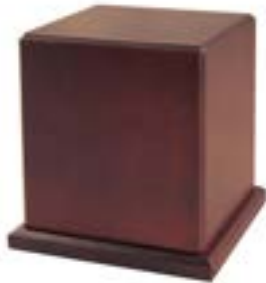
her oo r ce