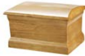
rt sa arthto e r ce