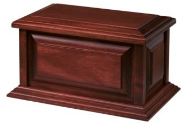
Brentwood Price: $385 Hardwood Victoriaville US210-00013 Size: 7Wx12Lx6.5D