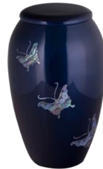
r le earl tter l r ce