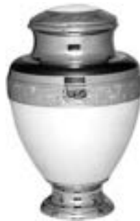
other o earl r ce