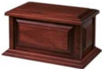
re t oo r ce