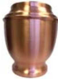
e t elCo er r ce