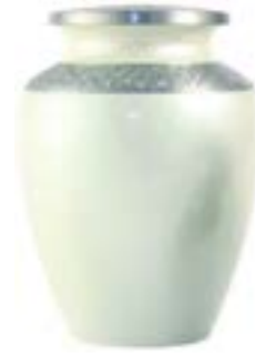
Celeste earl r ce