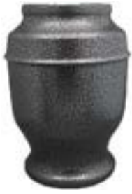
ha es or e ter r ce

Please, note a wider selection of urns are available on our website and upon request