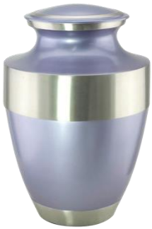
l te tarl ht r ce