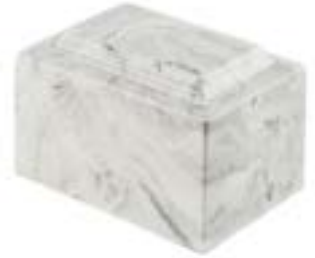
re to e ar le r ce