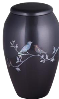
re o r s r ce