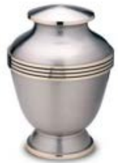
le a t e ter r ce 4