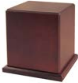
her oo r ce