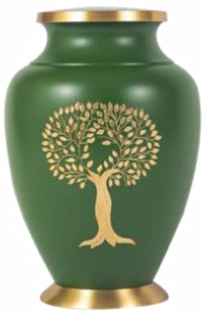
ree o e r ce