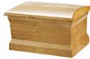
rt sa arthto e r ce