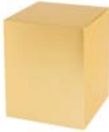
heet ro e r ce