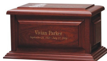
Fairmont Cherry Price: $510 Cherry Wood Eckels 3523 Size: 11.9"W x 7.4"L x 6.25"H