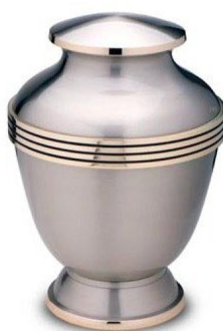
Elegant Pewter Price: $455 Brass Dodge 960251 Size: 12"H x 7.25"D Also available in copper, gold, sapphire and floral