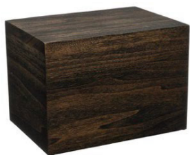
Mocha Hardwood Price: $225 Hardwood Batesville 255701 Size: 6"W x 5"D x 4"H Also available in light and medium wood