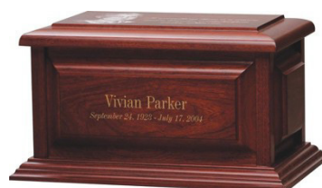
Fairmont Cherry Price: $510 Cherry Wood Eckels 3523 Size: 11.9"W x 7.4"L x 6.25"H