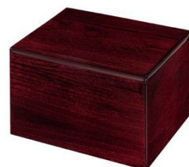
Traditional Price: $770 Wood Batesville 216023 Size: 10"W x 8"D x 6"H