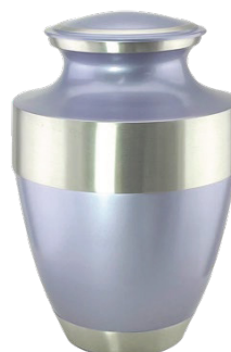
Elite Starlight Price: $385 Metal Victoriaville US430-05201 Size: 6"W x 10.25"H Also available in bronze