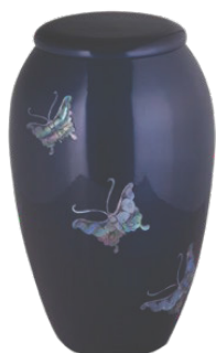
Purple Pearl Butterfly Price: $420 Aluminum Gravure craft UR-7100 Size: 6"D x 10.75"H