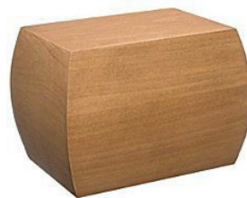
Braxton Maple Price: $275 Wood Batesville 255706 Size: 6.8"D x 6.5"H x 9.2"W Also available in honey brown