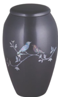
Grey Song Birds Price: $420 Aluminum Gravure craft UR-7124 Size: 6"W x 10"H Also available in purple