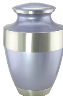
Elite Starlight Price: $385 Metal Victoriaville US430-05201 Size: 6"W x 10.25"H Also available in bronze