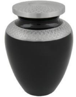
Elite Starlight Price: $300 Metal Victoriaville US430-05201 Size: 6"W x 10.25"H Also available in bronze