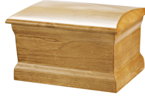
Artisan Earthtone Price: $250 Wood Victoriaville US150-00276 Size: 6"D x 10.5L x 7.5"W