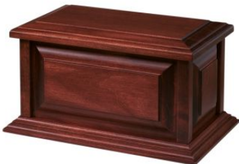
Brentwood Price: $340 Hardwood Victoriaville US210-00013 Size: 7Wx12Lx6.5D