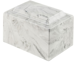
Greystone Marble Price: $300 Cultured Marble Victoriaville US335-20004 Size: 7Wx6.5Hx10L