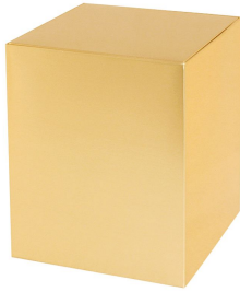
Sheet Bronze Price: $190 Brass Victoriaville US235-20001 Size: 5.6W x 5.6L x 7D