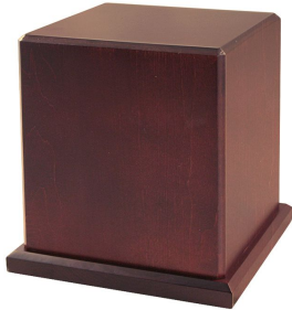
Sherwood Price: $310 Wood Victoriaville US150-00001 Size: 7.8"W x 8.4"D x 7.8"L