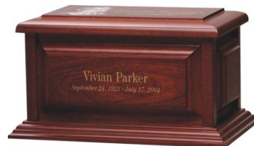
Fairmont Cherry Price: $510 Cherry Wood Eckels 3523 Size: 11.9"W x 7.4"L x 6.25"H