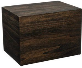
Mocha Hardwood Price: $225 Hardwood Batesville 255701 Size: 6"W x 5"D x 4"H Also available in light and medium wood