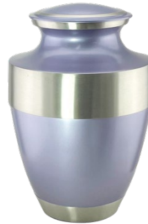
Elite Starlight Price: $385 Metal Victoriaville US430-05201 Size: 6"W x 10.25"H Also available in bronze