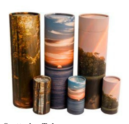
Scattering Tubes Full Size: $140 Mini: $70

Gravure craft 8101, 8106, 8107 Internal Size: 5.1"D x 12/6"H Material: Biodegradable Paper Many designs available