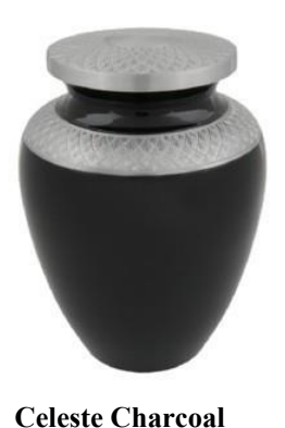
Alloy Dodge 941701 Size: 9.4D x 6.9"H Also available in indigo