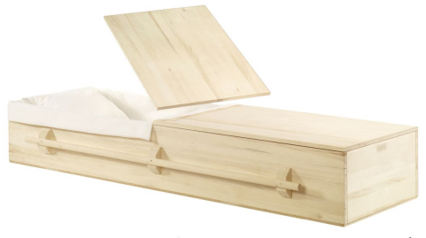
AVAILABLE IN OVERSIZE / DISPONIBLE EN SURDIMENSIONNÉ