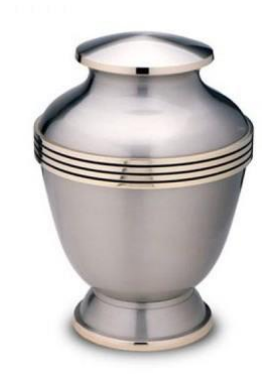
Elegant Pewter Price: $460 Brass Dodge 960251 Size: 12"H x 7.25"D Also available in copper, gold, sapphire and floral