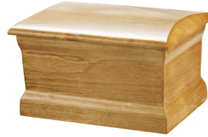
Artisan Earthtone Price: $250 Wood Victoriaville US150-00276 Size: 6"D x 10.5L x 7.5"W