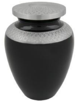
Celeste Charcoal Price: $330 Alloy Dodge 941701 Size: 9.4D x 6.9"H Also available in indigo