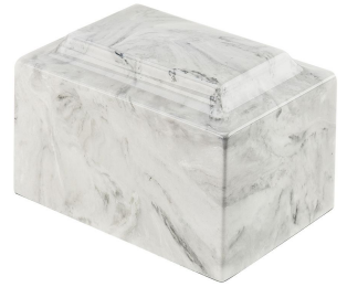
Greytone Marble Price: $300 Cultured Marble Victoriaville US335-20004 Size: 7Wx6.5Hx10L