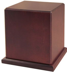
Sherwood Price: $310 Wood Victoriaville US150-00001 Size: 7.8"W x 8.4"D x 7.8"L