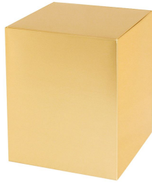
Sheet Bronze Price: $190 Brass Victoriaville US235-20001 Size: 5.6W x 5.6L x 7D