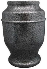
Thamesford Pewter Price: $170 Spun Aluminum Gravure craft UR-2009 Size: 8"H x 6"D Also available in copper and gold

(Please, note a wider selection of urns are available on our website and upon request)