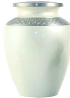
Celeste Pearl Price: $330 Alloy Dodge 941801 Size: 9.4"D x 6.9"H