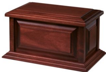
Brentwood Price: $340 Hardwood Victoriaville US210-00013 Size: 7Wx12Lx6.5D