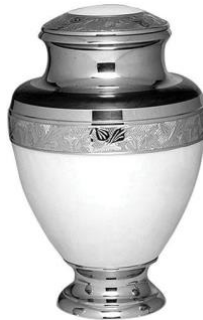
Mother of Pearl Price: $330 Metal Gravure craft UR-1734 Size: 7"D x 10"H