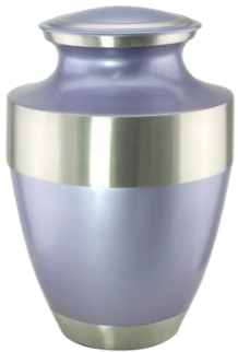
Elite Starlight Price: $300 Metal Victoriaville US430-05201 Size: 6"W x 10.25"H Also available in bronze