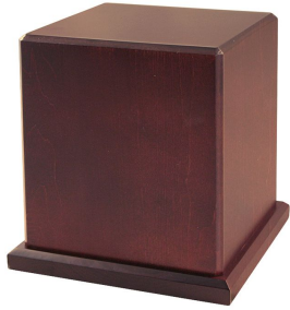
Sherwood Price: $310 Wood Victoriaville US150-00001 Size: 7.8"W x 8.4"D x 7.8"L