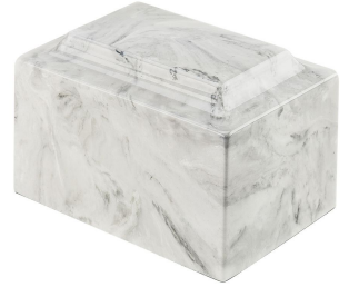
Greytone Marble Price: $300 Cultured Marble Victoriaville US335-20004 Size: 7Wx6.5Hx10L