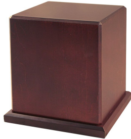
Sherwood Price: $310 Wood Victoriaville US150-00001 Size: 7.8"W x 8.4"D x 7.8"L