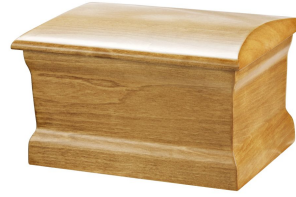
Artisan Earthtone Price: $250 Wood Victoriaville US150-00276 Size: 6"D x 10.5L x 7.5"W