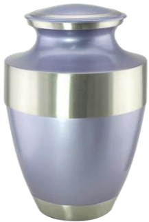
Elite Starlight Price: $300 Metal Victoriaville US430-05201 Size: 6"W x 10.25"H Also available in bronze