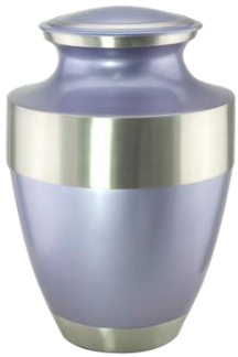
Elite Starlight Price: $300 Metal Victoriaville US430-05201 Size: 6"W x 10.25"H Also available in bronze