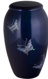
Purple Pearl Butterfly Price: $410 Aluminum Gravure craft UR-7100 Size: 6"D x 10.75"H