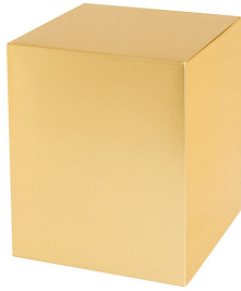
Sheet Bronze Price: $190 Brass Victoriaville US235-20001 Size: 5.6W x 5.6L x 7D