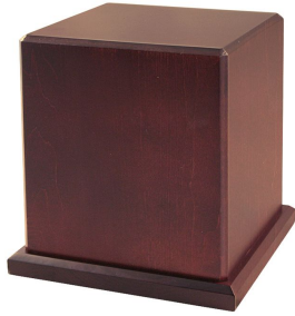
Sherwood Price: $310 Wood Victoriaville US150-00001 Size: 7.8"W x 8.4"D x 7.8"L