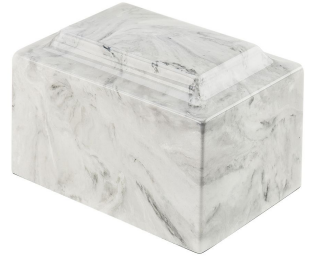
Greytone Marble Price: $300 Cultured Marble Victoriaville US335-20004 Size: 7Wx6.5Hx10L