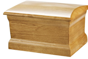
Artisan Earthtone Price: $250 Wood Victoriaville US150-00276 Size: 6"D x 10.5L x 7.5"W