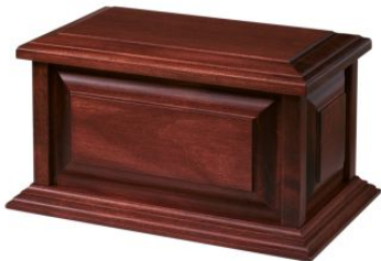
Brentwood Price: $340 Hardwood Victoriaville US210-00013 Size: 7Wx12Lx6.5D