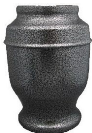
Thamesford Pewter Price: $170 Spun Aluminum Gravure craft UR-2009 Size: 8"H x 6"D Also available in copper and gold

(Please, note a wider selection of urns are available on our website and upon request)