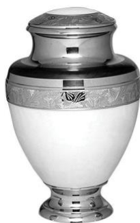
Mother of Pearl Price: $330 Metal Gravure craft UR-1734 Size: 7"D x 10"H