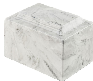
Greytone Marble Price: $300 Cultured Marble Victoriaville US335-20004 Size: 7Wx6.5Hx10L