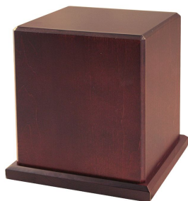
Sherwood Price: $310 Wood Victoriaville US150-00001 Size: 7.8"W x 8.4"D x 7.8"L