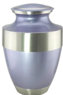
Elite Starlight Price: $300 Metal Victoriaville US430-05201 Size: 6"W x 10.25"H Also available in bronze