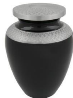
Celeste Charcoal Price: $330 Alloy Dodge 941701 Size: 9.4D x 6.9"H Also available in indigo