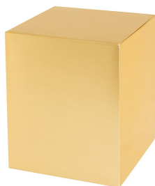
Sheet Bronze Price: $190 Brass Victoriaville US235-20001 Size: 5.6W x 5.6L x 7D