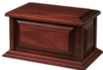
Brentwood Price: $340 Hardwood Victoriaville US210-00013 Size: 7Wx12Lx6.5D