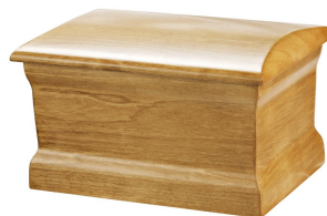
Artisan Earthtone Price: $250 Wood Victoriaville US150-00276 Size: 6"D x 10.5L x 7.5"W