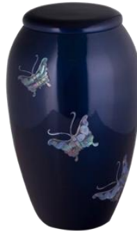
Purple Pearl Butterfly Price: $410 Aluminum Gravure craft UR-7100 Size: 6"D x 10.75"H