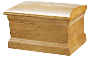
Artisan Earthtone Price: $250 Wood Victoriaville US150-00276 Size: 6"D x 10.5L x 7.5"W Also available in dark brown