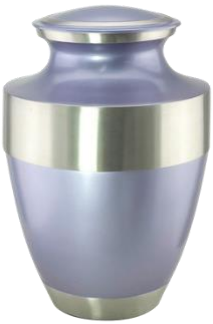
Elite Starlight Price: $300 Metal Victoriaville US430-05201 Size: 6"W x 10.25"H Also available in bronze