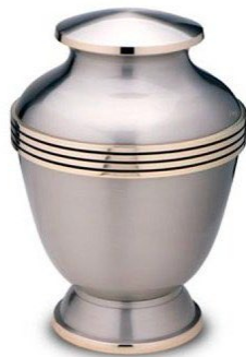
Elegant Pewter Price: $420 Brass Dodge 960251 Size: 12"H x 7.25"D Also available in copper, gold, sapphire and floral