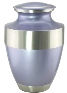
Elite Starlight Price: $385 Metal Victoriaville US430-05201 Size: 6"W x 10.25"H Also available in bronze