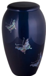
Purple Pearl Butterfly Price: $380 Aluminum Gravure craft UR-7100 Size: 6"D x 10.75"H