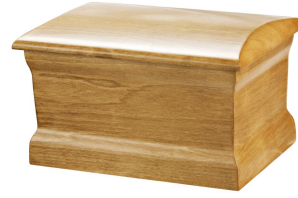
Artisan Earthtone Price: $250 Wood Victoriaville US150-00276 Size: 6"D x 10.5L x 7.5"W Also available in dark brown