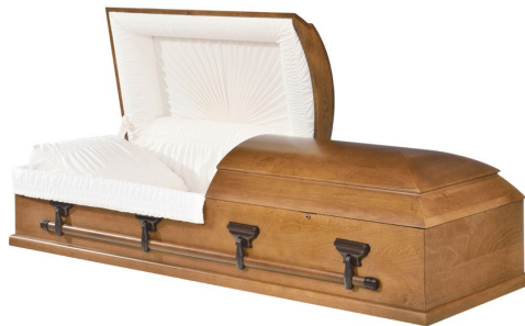
Puma Price: $1490 Victoriaville WR252-00180-CC Exterior Material: Poplar and Veneer Components, Rustic Brown Colour Interior: Beige Crepe Dimensions: 81L-27W-20H