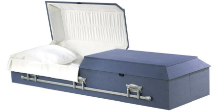
Toledo Price: $900 Victoriaville DR220-00040 Exterior: Blue Cloth Interior: White Silk Dimensions: 79.5L-25W-16.5H