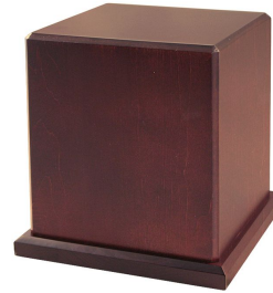
Sherwood Price: $310 Wood Victoriaville US150-00001 Size: 7.8"W x 8.4"D x 7.8"L