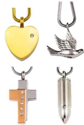
Cremation Pendants Price: $100 Gravure craft URJ-1350, 1000, 1390, 1210 Material: Stainless Steel Many designs available