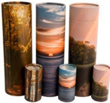
Scattering Tubes Full Size: $140 Mini: $70 Gravure craft 8101, 8106, 8107 Internal Size: 5.1”D x 12/6”H Material: Biodegradable Paper Many designs available