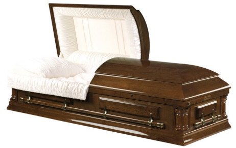
Newington Price: $1625 Victoriaville WC252-00008-CC Exterior Material: Poplar and Veneer Components, High Gloss Finish Interior: Tan Crepe Dimensions: 82.4L-28.3W-22.5H