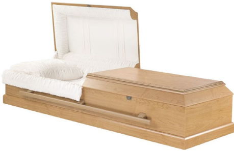
Alder Price: $1150 Victoriaville PV272-00005 Exterior: Woodgrain Interior: Beige Crepe Dimensions: 81.7L-29W-19.7H