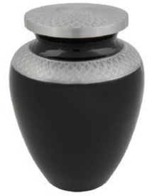
Celeste Charcoal Price: $290 Alloy Dodge 941701 Size: 9.4"D x 6.9"H Also available in indigo