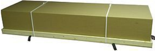
OSB Container Price: $150 Victoriaville CR199-00007 Exterior Material: Particle Board Model: Up to 250lbs Dimensions: 79L-24W-14H