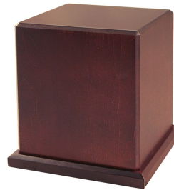
Sherwood Price: $310 Wood Victoriaville US150-00001 Size: 7.8"W x 8.4"D x 7.8"L