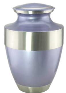
Elite Starlight Price: $450 Metal Victoriaville US430-05201 Size: 6"W x 10.25"H Also available in bronze