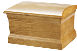
Artisan Earthtone Price: $250 Wood Victoriaville US150-00276 Size: 6"D x 10.5L x 7.5"W Also available in dark brown