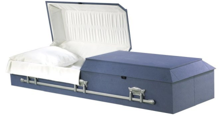
Toledo Price: $900 Victoriaville DR220-00040 Exterior: Blue Cloth Interior: White Silk Dimensions: 79.5L-25W-16.5H