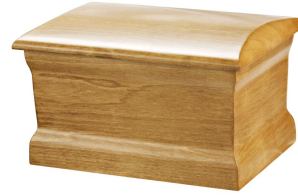
Artisan Earthtone Price: $250 Wood Victoriaville US150-00276 Size: 6"D x 10.5L x 7.5"W Also available in dark brown