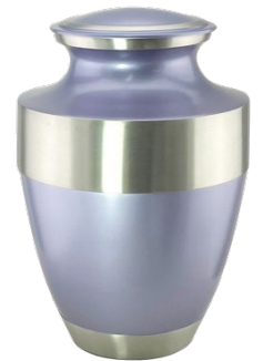
Elite Starlight Price: $385 Metal Victoriaville US430-05201 Size: 6"W x 10.25"H Also available in bronze