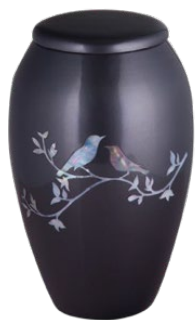
Grey Song Birds Price: $420 Aluminum Gravure craft UR-7124 Size: 6"W x 10"H Also available in purple