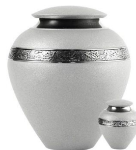
Shimmering Grey Price: $420 Metal Dodge 941900 Size: 8.5"D x 7.3"H