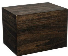
Mocha Hardwood Price: $225 Hardwood Batesville 255701 Size: 6"W x 5"D x 4"H Also available in light and medium wood