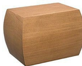
Braxton Maple Price: $275 Wood Batesville 255706 Size: 6.8"D x 6.5"H x 9.2"W Also available in honey brown