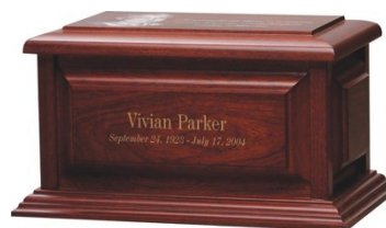
Fairmont Cherry Price: $510 Cherry Wood Eckels 3523 Size: 11.9"W x 7.4"L x 6.25"H