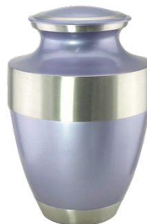
Elite Starlight Price: $385 Metal Victoriaville US430-05201 Size: 6"W x 10.25"H Also available in bronze