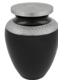
Celeste Charcoal Price: $330 Alloy Dodge 941701 Size: 9.4"D x 6.9"H Also available in indigo