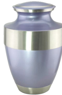
Elite Starlight Price: $385 Metal Victoriaville US430-05201 Size: 6"W x 10.25"H Also available in bronze