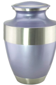
Elite Starlight Price: $265 Metal Victoriaville US430-05201 Size: 6"W x 10.25"H Also available in bronze