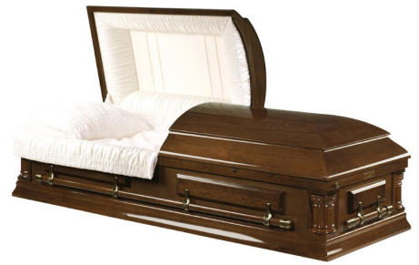
Newington Price: $1625 Victoriaville WC252-00008-CC Exterior Material: Poplar and Veneer Components, High Gloss Finish Interior: Tan Crepe Dimensions: 82.4L-28.3W-22.5H