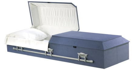
Toledo Price: $900 Victoriaville DR220-00040 Exterior: Blue Cloth Interior: White Silk Dimensions: 79.5L-25W-16.5H