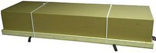
OSB Container Price: $150 Victoriaville CR199-00007 Exterior Material: Particle Board Model: Up to 250lbs Dimensions: 79L-24W-14H