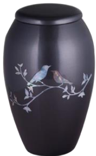
Grey Song Birds Price: $420 Aluminum Gravure craft UR-7124 Size: 6"W x 10"H Also available in purple