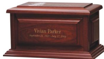
Fairmont Cherry Price: $510 Cherry Wood Eckels 3523 Size: 11.9"W x 7.4"L x 6.25"H