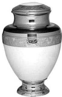
Mother of Pearl Price: $330 Metal Gravure craft UR-1734 Size: 7"D x 10"H