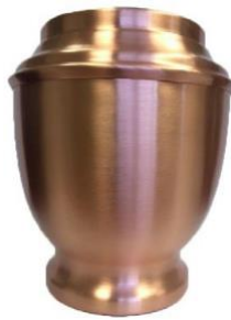
Sentinel Copper Price: $240 Copper Gravure craft UR-1403C Size: 6.5"D x 8"H Also available in gold and pewter