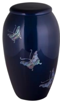
Purple Pearl Butterfly Price: $420 Aluminum Gravure craft UR-7100 Size: 6"D x 10.75"H