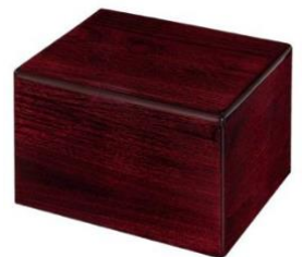
Traditional Price: $770 Wood Batesville 216023 Size: 10"W x 8"D x 6"H