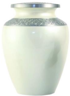
Celeste Pearl Price: $330 Alloy Dodge 941801 Size: 9.4"D x 6.9"H