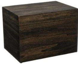
Mocha Hardwood Price: $225 Hardwood Batesville 255701 Size: 6"W x 5"D x 4"H Also available in light and medium wood