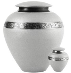
Shimmering Grey Price: $420 Metal Dodge 941900 Size: 8.5"D x 7.3"H