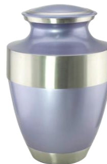
Elite Starlight Price: $385 Metal Victoriaville US430-05201 Size: 6"W x 10.25"H Also available in bronze