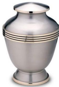
Elegant Pewter Price: $455 Brass Dodge 960251 Size: 12"H x 7.25"D Also available in copper, gold, sapphire and floral