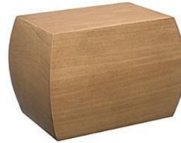
Braxton Maple Price: $275 Wood Batesville 255706 Size: 6.8"D x 6.5"H x 9.2"W Also available in honey brown