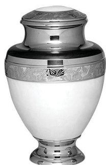
Mother of Pearl Price: $245 Metal Gravure craft UR-1734 Size: 7"D x 10"H