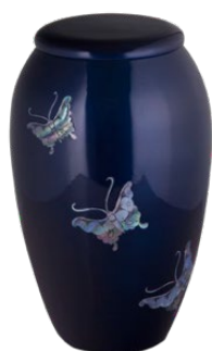
Purple Pearl Butterfly Price: $310 Aluminum Gravure craft UR-7100 Size: 6"D x 10.75"H