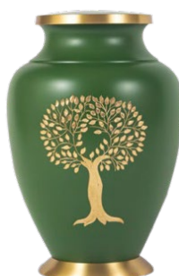
Tree of Life Price: $255 Brass Gravure craft UR-3101 Size: 6.25"D x 9.75"H