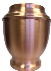
Sentinel Copper Price: $215 Copper Gravure craft UR-1403C Size: 6.5"D x 8"H Also available in gold and pewter