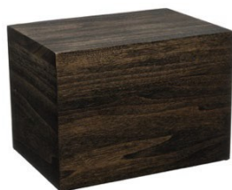
Mocha Hardwood Price: $160 Hardwood Batesville 255701 Size: 6"W x 5"D x 4"H Also available in light and medium wood