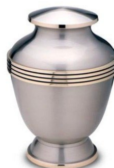
Elegant Pewter Price: $335 Brass Dodge 960251 Size: 12"H x 7.25"D Also available in copper, gold, sapphire and floral