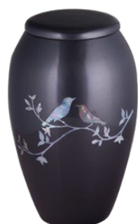
Grey Song Birds Price: $310 Aluminum Gravure craft UR-7124 Size: 6"W x 10"H Also available in purple