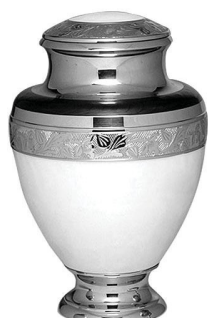
Mother of Pearl Price: $245 Metal Gravure craft UR-1734 Size: 7"D x 10"H