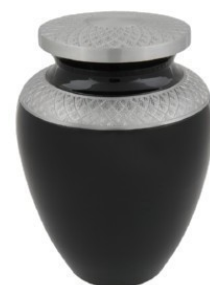
Celeste Charcoal Price: $235 Alloy Dodge 941701 Size: 9.4"D x 6.9"H Also available in indigo