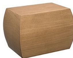
Braxton Maple Price: $235 Wood Batesville 255706 Size: 6.8"D x 6.5"H x 9.2"W Also available in honey brown