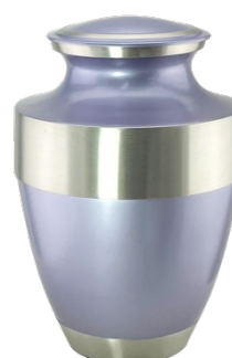
Elite Starlight Price: $265 Metal Victoriaville US430-05201 Size: 6"W x 10.25"H Also available in bronze