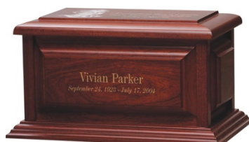
Fairmont Cherry Price: $320 Cherry Wood Eckels 3523 Size: 11.9"W x 7.4"L x 6.25"H