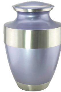
Elite Starlight Price: $265 Metal Victoriaville US430-05201 Size: 6"W x 10.25"H Also available in bronze