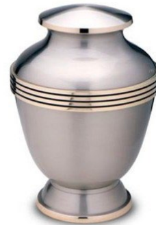
Elegant Pewter Price: $335 Brass Dodge 960251 Size: 12"H x 7.25"D Also available in copper, gold, sapphire and floral