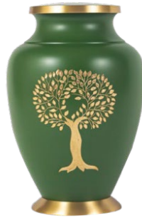
Tree of Life Price: $255 Brass Gravure craft UR-3101 Size: 6.25"D x 9.75"H