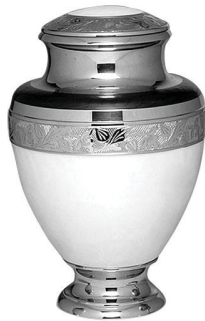
Mother of Pearl Price: $245 Metal Gravure craft UR-1734 Size: 7"D x 10"H