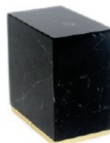
Econo Champlain Price: $400 Marbel Victoriaville US 315 - 00014 Size: 10"Hx5"W