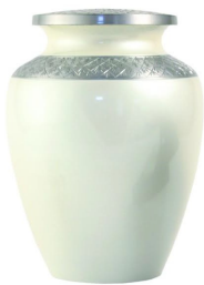
Celeste Pearl Price: $180 Alloy Dodge 941801 Size: 9"Dx6"H