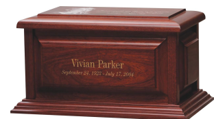
Fairmont Cherry Price: $425 Cherry wood Eckels 3523 Size: 11.9"Wx7.4"Dx6.25"H