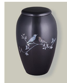
Grey Song Birds P Price: $325 Aluminum/ Mother of Pearl Gravure Craft UR 7124 S Size: 10"Hx6"W