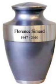
Starlight Price: $270 Metal Victoriaville US430-05201 Size: 6"W x 10"H