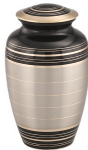
Pewter Black Price: $250 Metal Victoriaville US210-3001 Size: 6"D x 10"H