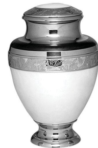
Elegant Pearl Price: $260 Metal Maritime US210-30048 Size: 10"H x 7"D