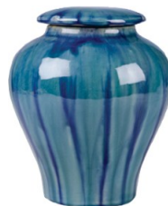
Spring Rain Price: $300 Ceramic Victoriaville US 550 - 0004 Size: 9.5H"D x 7"W