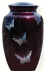
Pearl Butterfly Price: $325 Aluminum/ Mother of Pearl Gravure Craft UR 7100 Size: 10"Hx6"W