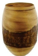
Mangowood Price: $330 Mangowood Gravure Craft UR 7200 Size Varies