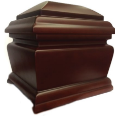
Bristol Price: $175 Rosewood Dodge 972353 Size: 8"H x 8.125L x 7"W