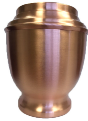
Sentinal Price: $170 Copper Gravure Craft UR 1403C Size: 6.5"D x 8"H