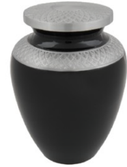
Charcoal Price: $180 Alloy Dodge 941701 Size: 9"Dx6"H