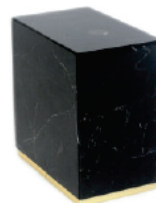
Econo Champlain Price: $400 Marbel Victoriaville US 315 - 00014 Size: 10"Hx5"W