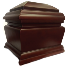
Bristol Price: $175 Rosewood Dodge 972353 Size: 8"H x 8.125L x 7"W