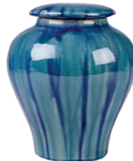
Spring Rain Price: $300 Ceramic Victoriaville US 550 - 0004 Size: 9.5H"D x 7"W