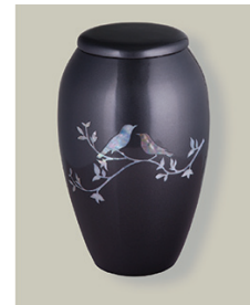
Grey Song Birds Price: $325 Aluminum/ Mother of Pearl Gravure Craft UR 7100 Size: 10"Hx6"W