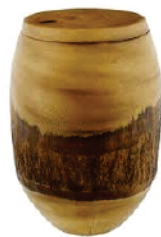
Mangowood Price: $330 Mangowood Gravure Craft UR 7200 Size Varies