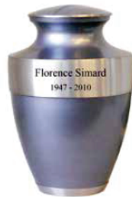
Starlight Price: $270 Metal Victoriaville US430-05201 Size: 6"W x 10"H