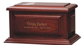
Fairmont Cherry Price: $425 Cherry wood Eckels 3523 Size: 11.9"Wx7.4"Dx6.25"H