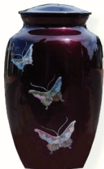
Pearl Butterfly Price: $325 Aluminum/ Mother of Pearl Gravure Craft UR 7124 Size: 10"Hx6"W