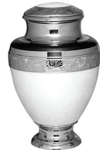
Elegant Pearl Price: $260 Metal Maritime US210-30048 Size: 10"H x 7"D