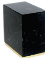
Econo Champlain Price: $400 Marbel Victoriaville US 315 - 00014 Size: 10"Hx5"W