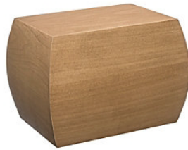
Braxton Maple Price: $225 Wood Batesville 255706 Size: 6.88"Dx6.5"Hx9.25"W